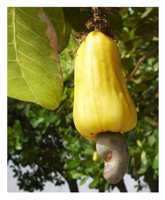
FIGURE 1 - Cashew: nut and apple (yellow)

The plant is found in Central America, Africa, Asia and India, Vietnam and Brazil stand out as the largest producers of cashew nut (70% of the world production).