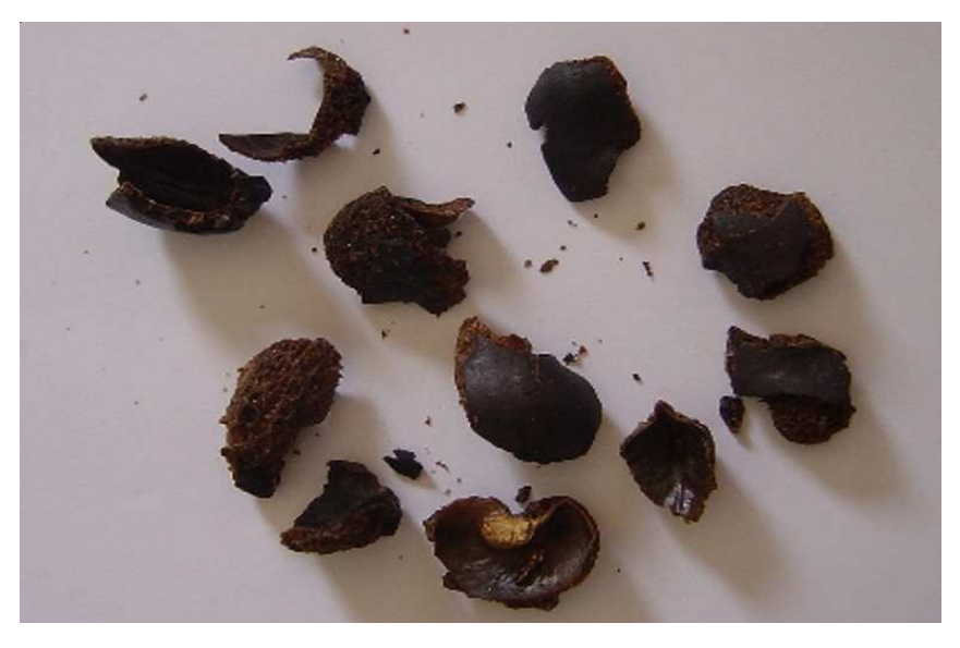
FIGURE 2 – Rinds of cashew nuts after burning on LCC: non-uniforms pieces

and CNSL is destined for exportation (SANTOS et al. 2007). The rinds of cashew nut (wastes of nuts' production) are burned again during the heating process (Fig. 2), and in boilers, they'll generate heat for shelling other nuts. The ARCN is the waste collected from the boiler grid, resulted from burning of the rind of nuts. This waste is used as composts in plantings of cashew and a little part of it is dumped in landfill sites (LIMA, 2008).