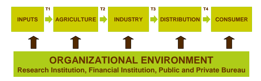
Fig. 4. Organization Environment

part of organizational environment. For this level, bureaucracy considered, what means "the support staff that is responsible for developing plans, collecting and processing information. operationalizing implementing executive decisions. auditing performance, and, more generally, providing direction to the operating parts of a hierarchical enterprise." (Williamson, 1996, p.377)