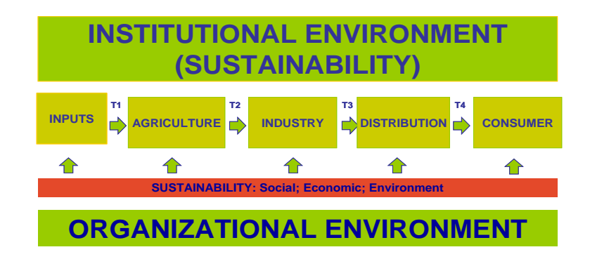
Fig. 2. Sustainable Agribusiness system and typical transaction Adapted from Zylbersztajn (1995)

The sustainability comprehends three different components such as the economic development, the environment and the social aspects. Therefore, the analysis is not only focused on products, but environment friendly production system and improvement of life quality are also taken into account. Considering sustainable aspects, the benefits may not be limited to the agents of AGS, and positive externalities might come from coordinated and sustainable transactions among all agents of chain (Neves and Castro, 2008). When all agents are coordinated there is an assumption that they will answer better for new environment and the adaptation will happen in a costless way.