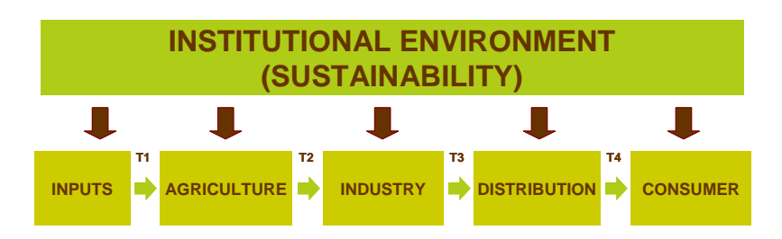
Fig. 6. Institutional Environment

aspects are part of institutional environment and institutional arrangement. Therefore, contracts performance also concerns sustainability aspects.